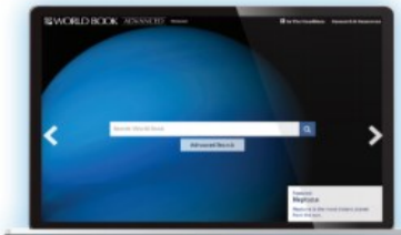
Ages 14 and up

A visually stunning resource with intuitive iconography, Kids provides thousands of easy-to-read articles with embedded multimedia for increased comprehension. Includes fantastic age-appropriate resources, such as Important People, Science Projects, Webquests, and games.